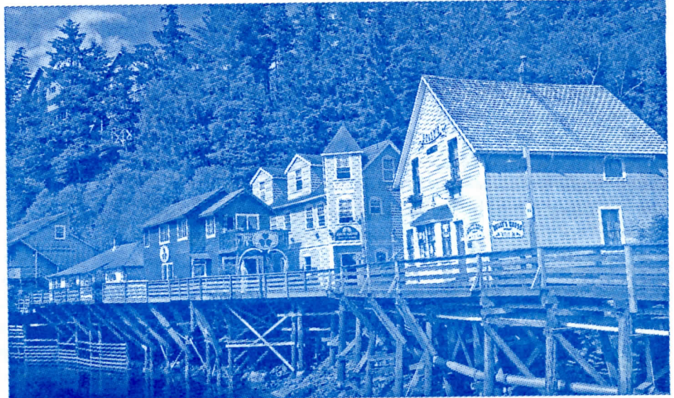
Historic Creek Street